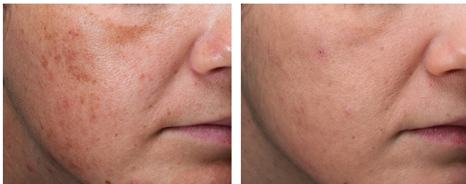
Before and after 3 treatments

Dr. Saedi says "The PicoSure Pro device is phenomenal for treating pigmentation, specifically in skin of color and is a great compliment to other procedures such as injectables and/or other energy-based devices. My patients love the PicoSure Pro treatment for its' effectiveness, safety, and lack of downtime. I would recommend this to anyone looking to safely and effectively treat pigmentation."